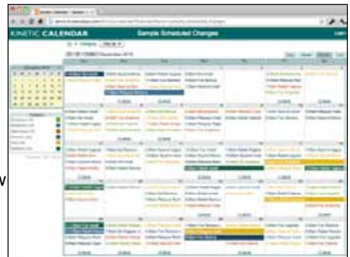
Kinetic Calendar End User View